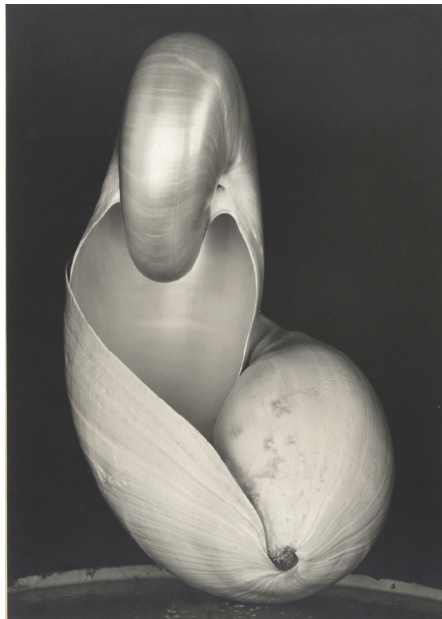
Edward Weston Two Shells, 1927 from SFMOMA Albert M. Bender Collection

Open to all undergraduates and graduates studying in the US. Design For America asks you to create a 2-minute video on an idea that can reduce waste water in some way.