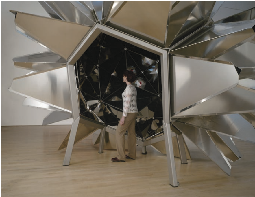
Olafur Eliasson Multiple Gratto , 2004 From Take your time : Olafur Eliasson