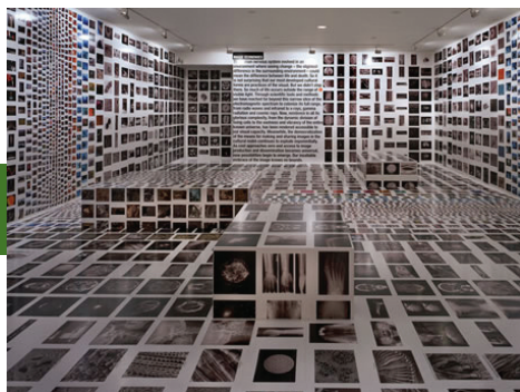
Massive Change Exhibit Vancouver Art Gallery