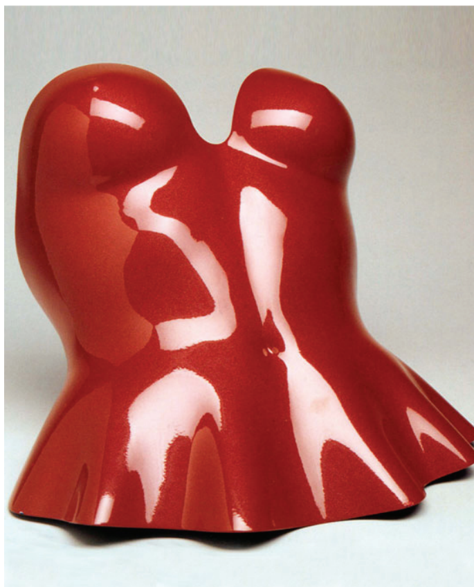
Issey Miyake Molded plastic red bustier, 1983 Japan, gift of Krizia Co.

The Braun Prize seeks to promote the work of young designers from all over the world, to recognize the work of design schools, and to help develop a greater appreciation of the factors and criteria which make for good product design. The winner of the Braun Prize will receive 12,000 Euros in prize money or a paid internship in the Design Department at Braun.